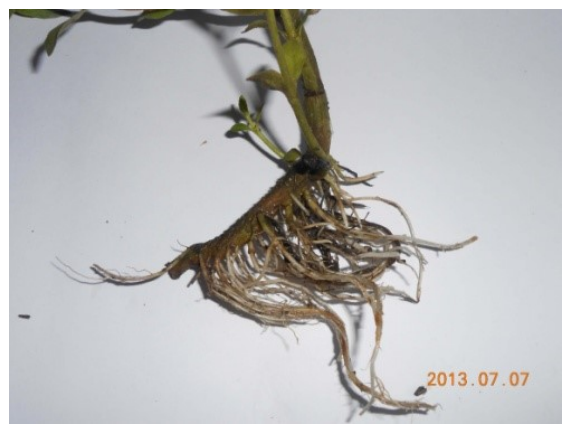
Fig.4 Roots of Eclipta alba