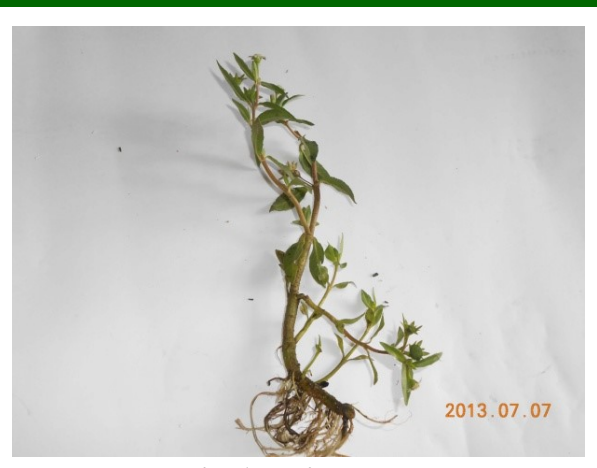
Fig. 1 Entire Plant