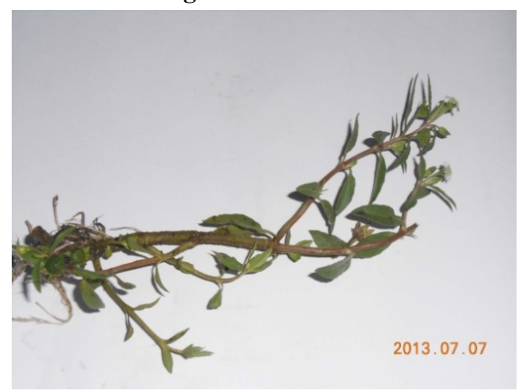
Fig. 2 Entire Plant