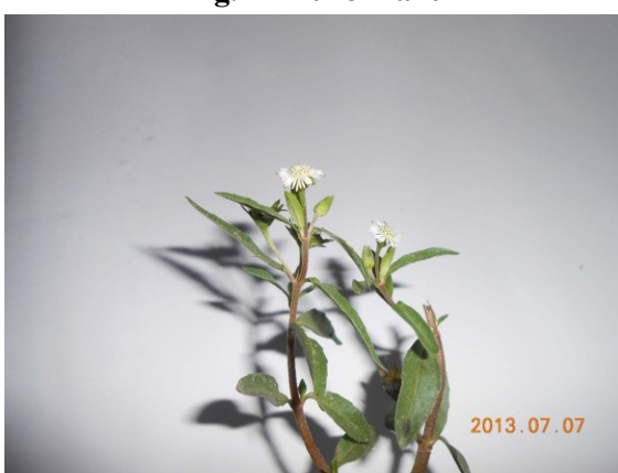
Fig. 3 Inflorescence