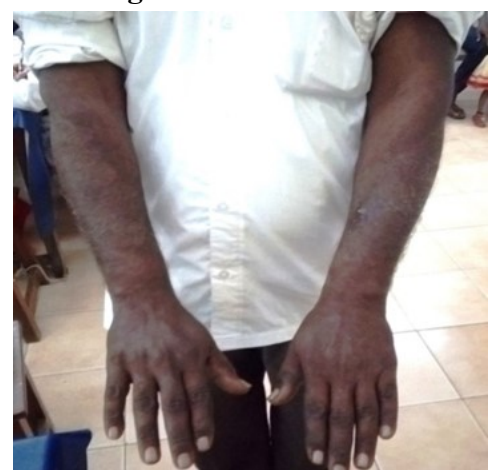
Fig 2: After treatment

Pharmacological researches on few drugs like Haritaki, Nimba and Saptaparna have shown that these ingredients acts at the skin level and helps the skin to become healthy. Viz; Haritaki exhibited potent improvement of erythema and scaling scores, decrease of epidermal, ear and skin-fold thickening, decrease of tumor necrosis factor \alpha (TNF \alpha ), interleukin (IL)-17A, IL-23 and matrix metalloproteinase (MMP)-9 expression and decrease of keratinocyte proliferation. [11]