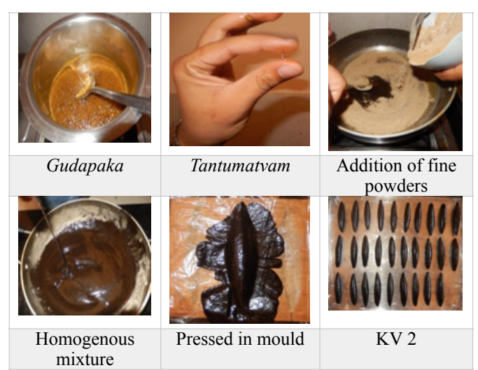
Fig 2: Preparation fo Kasisadi Varti by Gupaka Method - KV 2

Pressed in mould KV 1 Fig 1: Preparation of Kasisadi Varti by Bhavana Method - KV 1