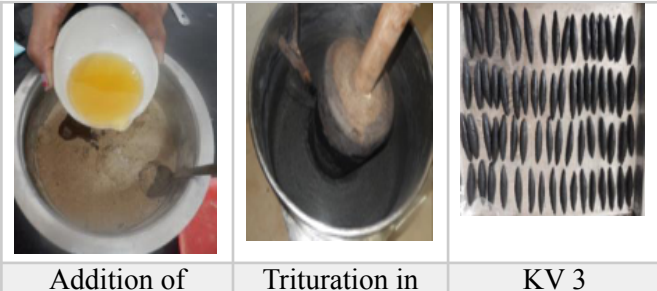
Fig 3: Preparation of Kasisadi Varti by Modified Methods - KV3

Ingredients of Kasisadi Varti (table 1) were taken in equal quantity. They were pounded separately, sieved to obtain fine powders. Cocoa butter was melted by indirect heating and mixed with the fine powders. Then the mixture was taken in wet grinder and water sufficient to immerse the Churna was added. The mixture was subjected for continuous and cautious trituration. As and when the contents dried, water was added and the quantity was noted. Two days Bhavana was given. After attaining Subhavita Lakshana, the mass was made into Varti form with the help of mould. Then it was dried and stored. The images of preparation are given in fig 3.