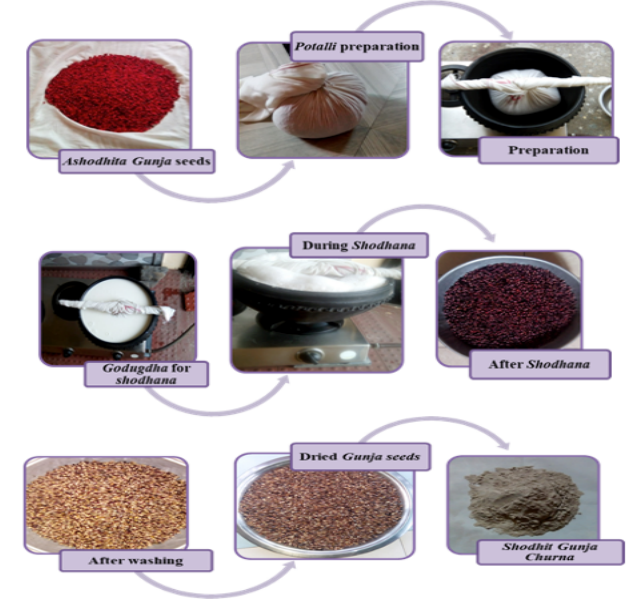
Fig. 3: Shodhana of Gunia

Two Kg of Gunja (Abrus precatorius) seeds were tied in a two layered cloth and the pottali was kept suspended in six liters of cow milk taken in an earthen pot ( dolayantra ). The milk was boiled with the Gunja seed pack suspended for 1 Yama (3 hours). After this, the seeds were taken out, washed in hot water, outer cover was removed and cereal thus obtained were dried in sun shade. 900 gm fine powder was obtained for further process.