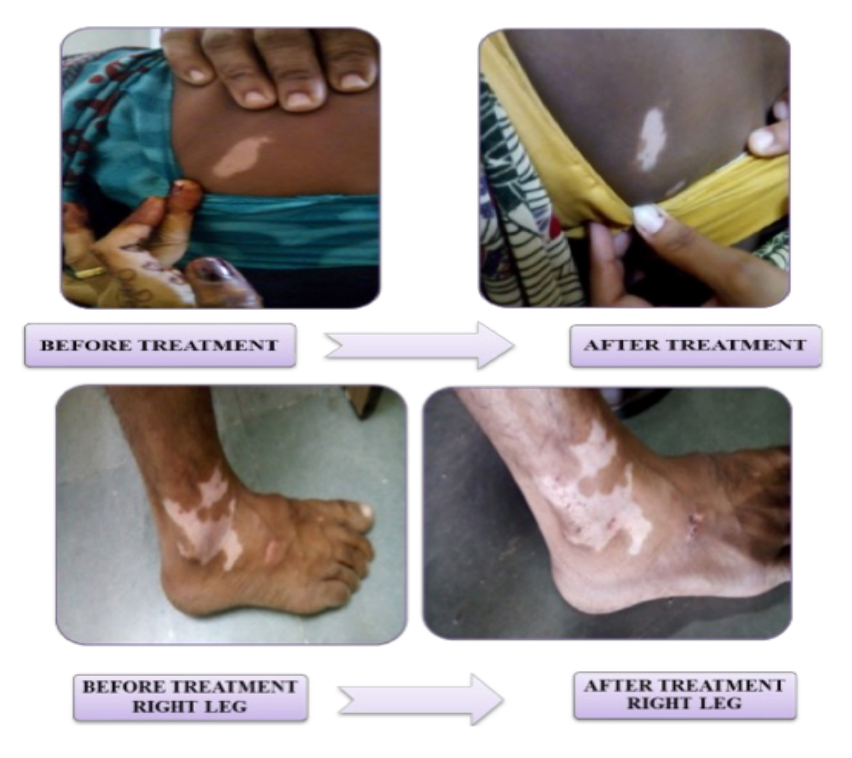
Fig.6: Images of patient