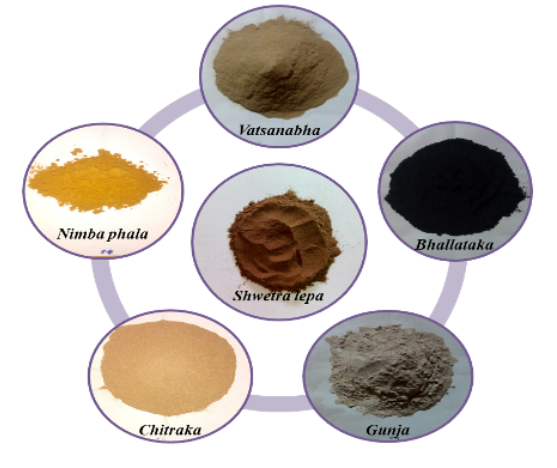
Fig. 4: Preparation of Shwetra lepa vati