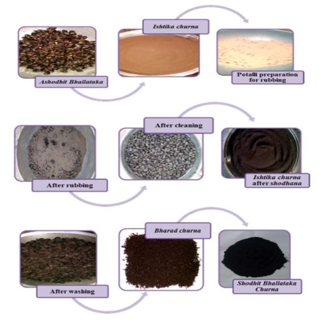
Fig.2: Shodhana of Bhallataka

Two Kg of Bhallataka (Semicarpus anacardium) fruits were kept in Ishtika churna (brick powder) after removing crown and were rubbed till brick powder soaked with oil and cover of fruit was peeled off. Bhallataka fruits were washed with hot water to remove Ishtika churna particles. After drying, fine powder was prepared (750 gm).