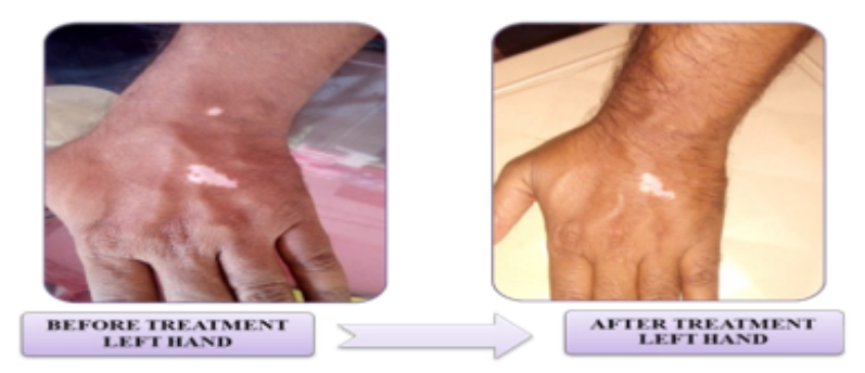
Fig.7: Images of patient